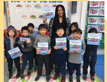
1st grade students receive book donations at Olivet Academy.