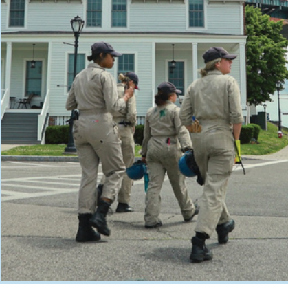
SUNY Maritime Cadets reporting to hands-on ship training.

Representation is a collective effort throughout the maritime industry and we are compelled to assist in creating more opportunities for youth identifying as BIPOC and/or Female. Maritime & STEM have typically been exclusionary versus inclusive. Our goal is to encourage exposure to the industry for these specific communities by helping to elevate visibility of representation. By showcasing current students and young professionals, youth may be more receptive to the opportunities available to them in the industry and would see a true reflection of peers.